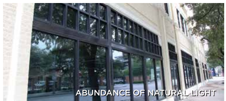
ABUNDANCE OF NATURAL LIGHT