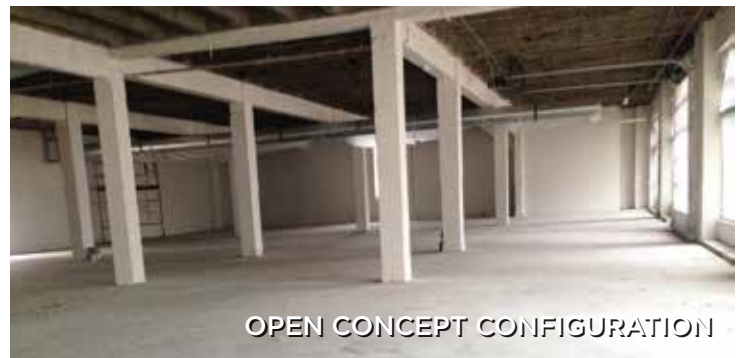
OPEN CONCEPT CONFIGURATION

Extended 15' high ceilings, exposed beams & columns, and original polished concrete floors