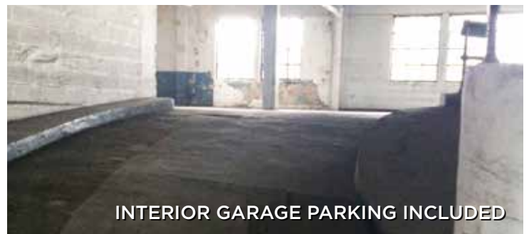
INTERIOR GARAGE PARKING INCLUDED